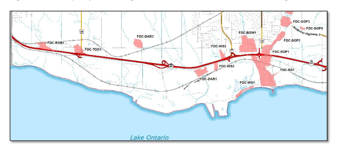
Figure 2: Municipality of Clarington Waterfront Areas and Flood Damage Centres