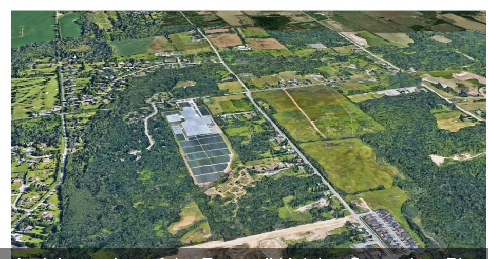
Aerial overview of the Farewell Heights Secondary Plan Area